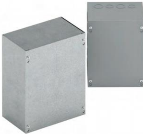
Junction Box Type 1 Model # SAL161166SC-JBT1